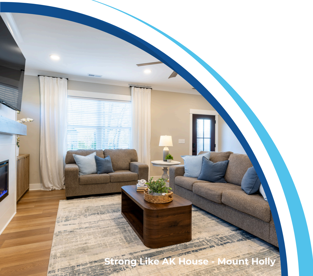
Strong Like AK House - Mount Holly

Strong Like AK exists to ensure families are met with comfort, financial care, and meaningful moments, so they can focus on what matters most: their child.